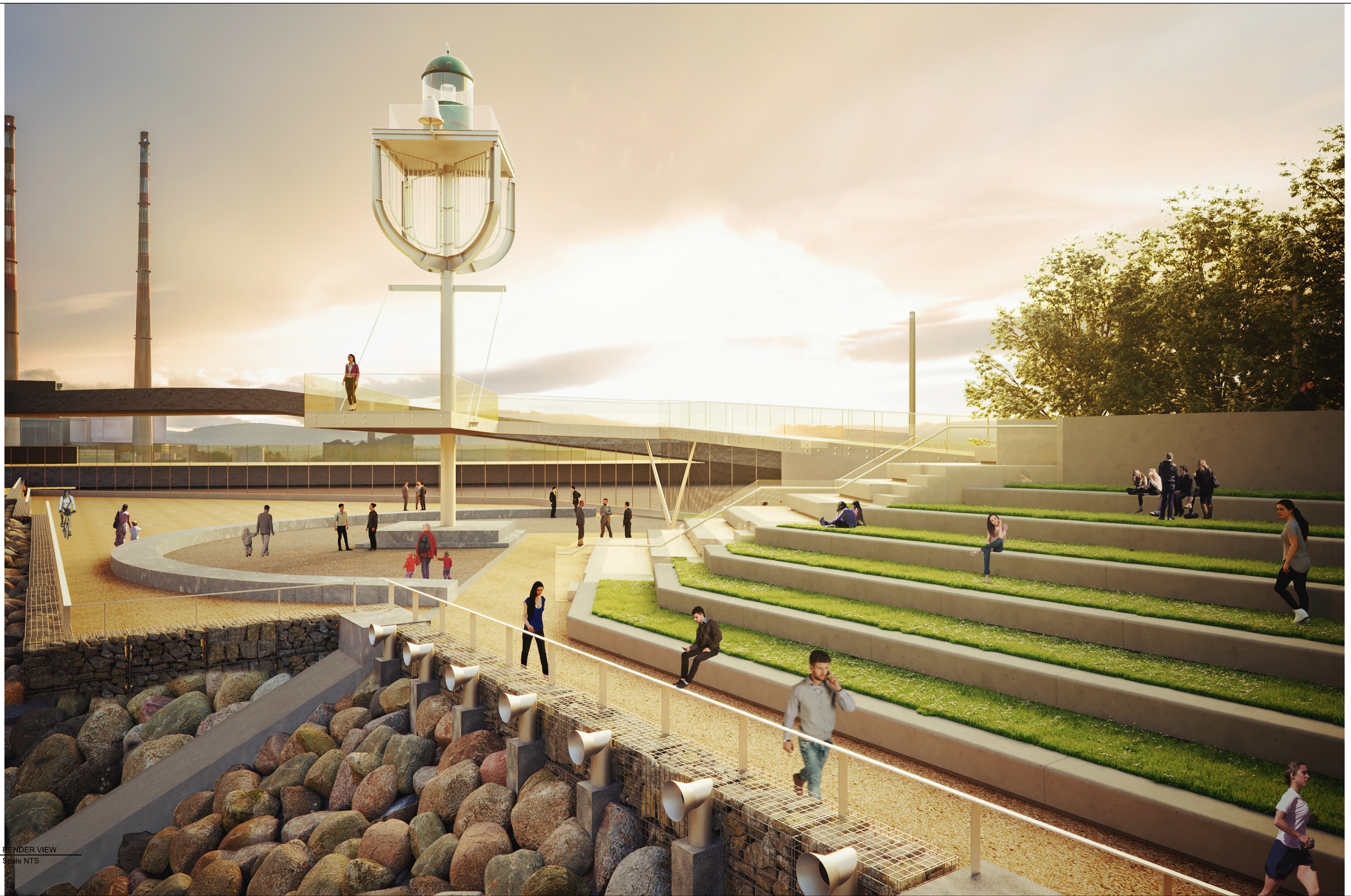
01 RENDER VIEW 2900 Scale NTS